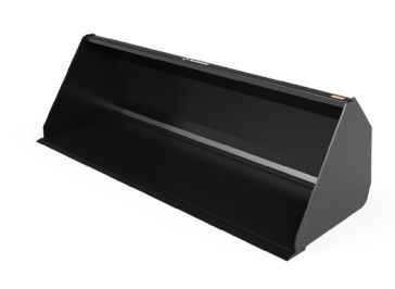
Standard Long 94"

The Norden Euro Loader Bucket's design includes a strong frame, reinforced edges, and a spacious capacity, enabling it to scoop, carry, and deposit various materials such as soil, gravel, sand, and debris with ease. This bucket gives the operator exceptional maneuverability and precise control, proving to be an indispensable tool for construction, landscaping, agriculture, and other industries requiring efficient material handling operations.