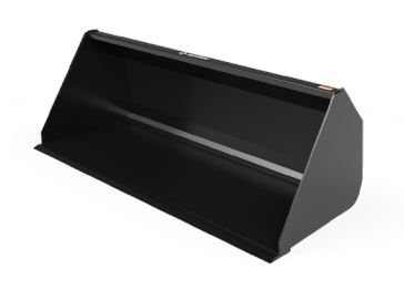
Utility Short 82"