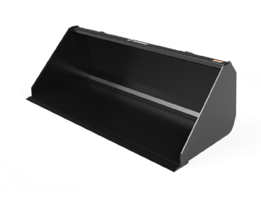
Utility Short 72"