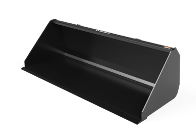
Standard Long 82"